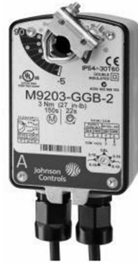
M9203-xxx-2(Z) Series Electric Spring-Return Actuator